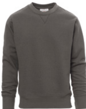
Smoke / Smoke