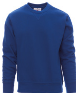
Blu royal / Royal blue