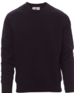
Nero / Black