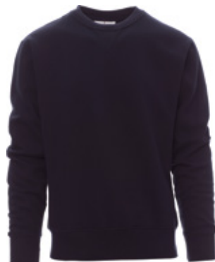
Blu navy / Navy blue