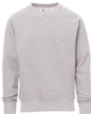
Grigio melange / Melange grey